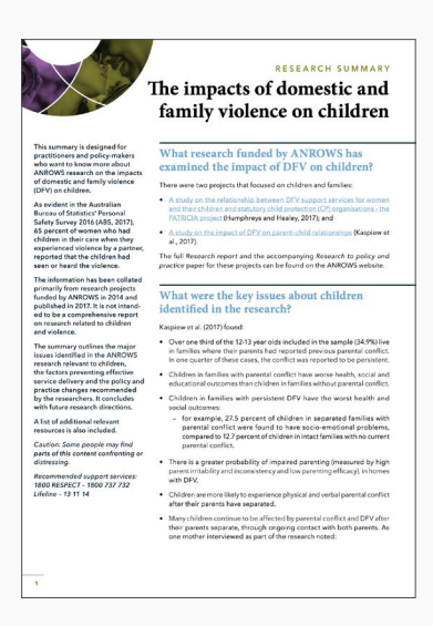
Research summary: The impacts of domestic and family violence on children