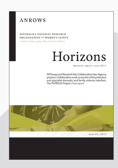
The PATRICIA Project: Pathways And Research In Collaborative Inter-Agency working