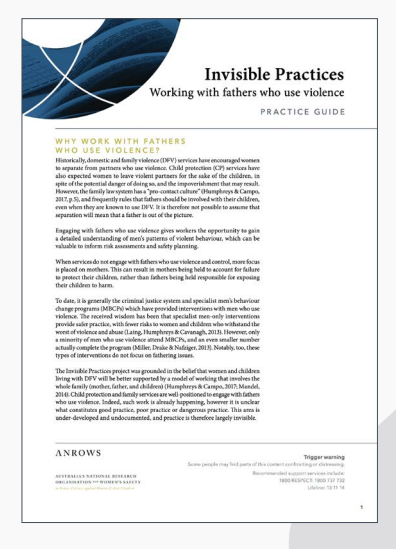
Practice guide: Invisible Practices – Working with fathers who use violence